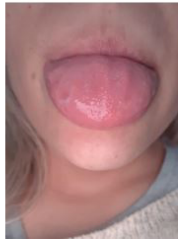
Figure 8. After 2 months of surgical procedure.