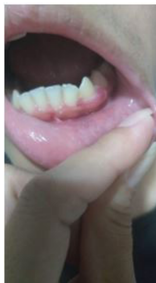
Figure 2. After application of 1.5 ml of ethamolin.