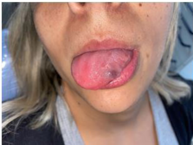
Figure 5. Lesion on the lingual dorsum, with around 1.8cm of diameter.