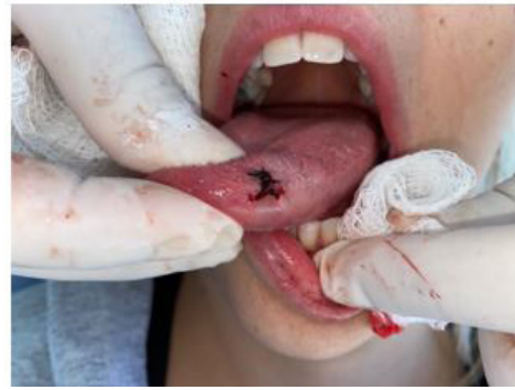
Figure 7. Excisional biopsy of the lesion.